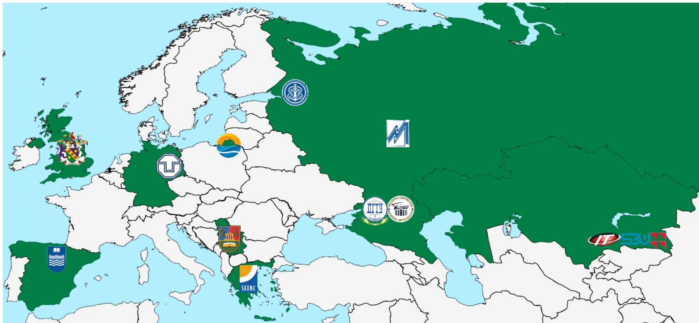
International online conference „Modelling e4e processes: innovative educational programmes and network partnership“, Rostov on Don, 9-11.9.2020